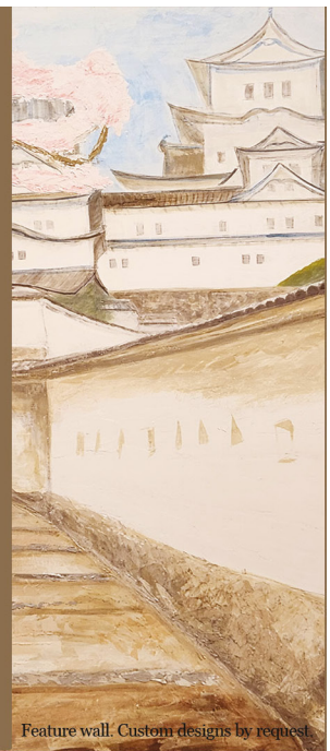
Feature wall. Custom designs by request.