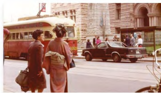
Women of Change: Celebrating Japanese Canadian Leaders Mar 8, 2021-Apr 1, 2023 More Info >

July is Natsu Matsuri month at the JCCC! We are proud to be able to celebrate in person with you during our Bon Odori Festival on Saturday July 9, but understand that not everyone will be able to visit us in person. For those of you who would like to visit us virtually, we offer a wide variety of activities on our website at https://jccc.on.ca/event/2021/07/natsu-matsuri-obon-2021 .