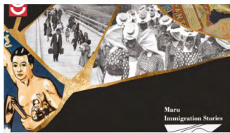
Maru: Immigration Stories Sep 19, 2021-Sep 20, 2026 More Info >

As always, check out our website to links from current online exhibits and past online exhibits.