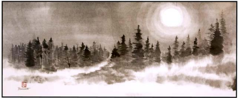
Hiroshi Yamamoto's "Moonlit Night" - Ruth Yamada Award, 2015

1 last suite (672 sq. ft.) available for rent at JCCC. If interested, please contact Nao Seko at (416) 444-9900 x227.