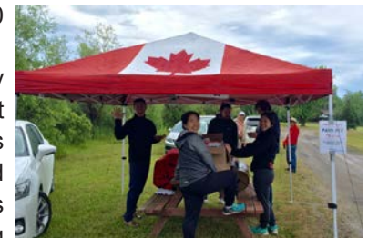
Front gate welcoming committee greeting cars

Our thanks to the many volunteers who helped out and all the picnickers who came out. At the end of the day, all attendees left with full bellies and big smiles!