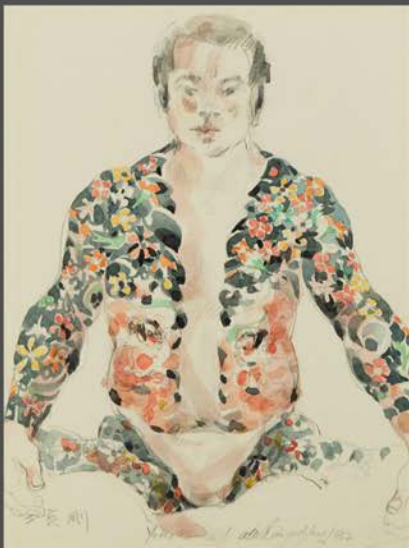
Aba Bayefsky, Watercolour, 'Yokohama, 1982'