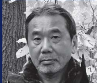
HONOURING HARUKI MURAKAMI