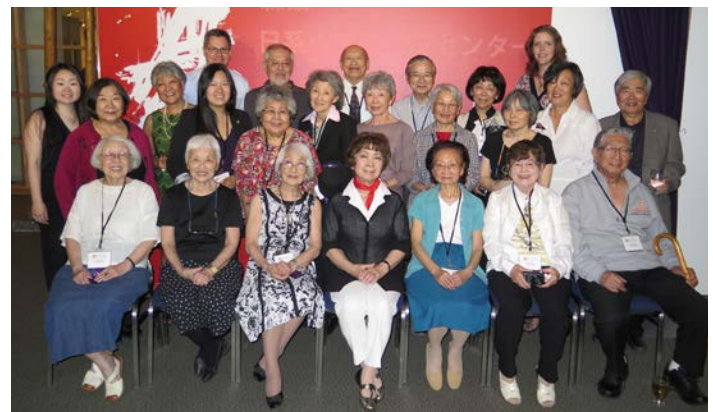
Some members of the JCCC Archives Committee.