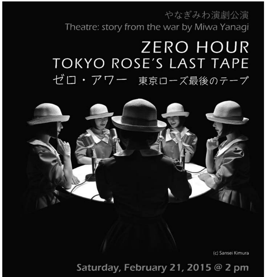
Aichi Triennale 2013

Ticket sale starts Monday December 1, 2014. Reserved seating only.