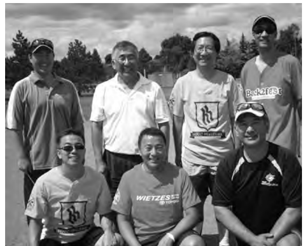
JC3-Pitch Captains and Organizers (Left to Right):