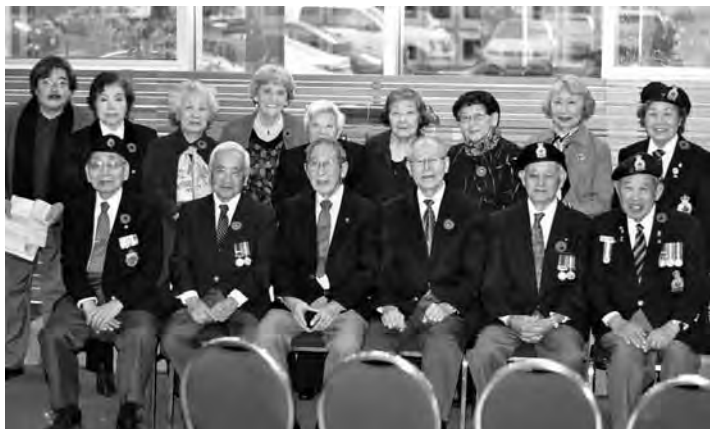
The Nisei veterans and their families.

The JCCC thanks these courageous men and women for all they have done for us and our country.