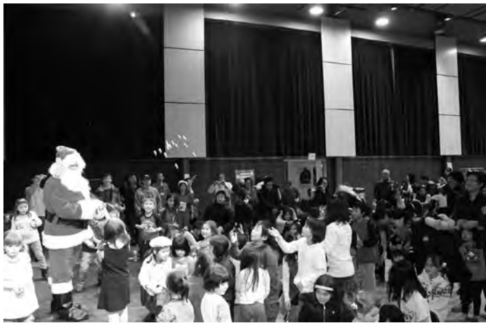
Winter Family Festival 2012.

日時: 2012年12月8日(日) 、午後12時—午後4時 入場料*: 大人 $ 5、子供 $ 3 (4—15歳)、3歳以下無料 *WFFポストカードをご持参の方には1家族につきもれなく3枚のアクティビティチケットを差し上げます。