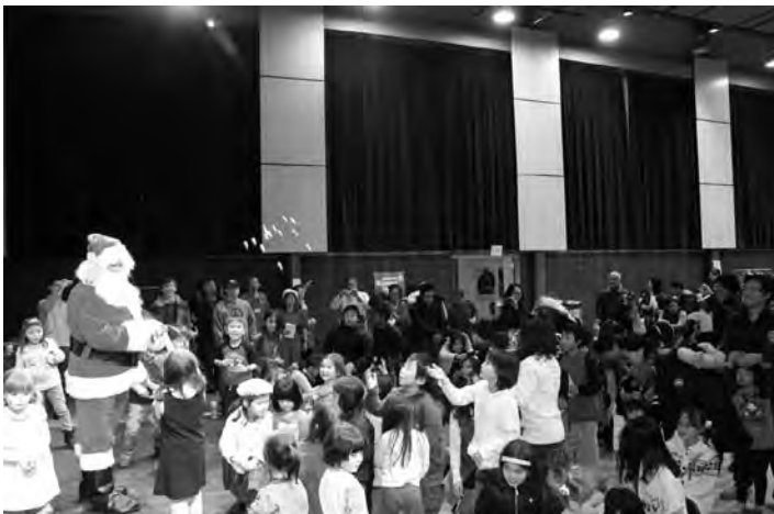
Winter Family Festival 2012.