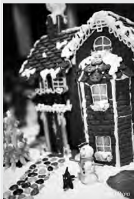
Last year's winner.

Last year we had some incredible entries for the Gingerbread House Decorating Contest, and we hope everyone will participate again this year. We are currently open to entries for this year's contest, and we have added some new categories to include Best Overall Winner, Most Original and Children's Choice. There's a limit to the number of entries this year, so register early to avoid disappointment. Forms can be downloaded from the JCCC website www.jccc.on.ca , or you can pick one up at JCCC reception. Registration can be made in person, by phone 416-441-2345 or by email