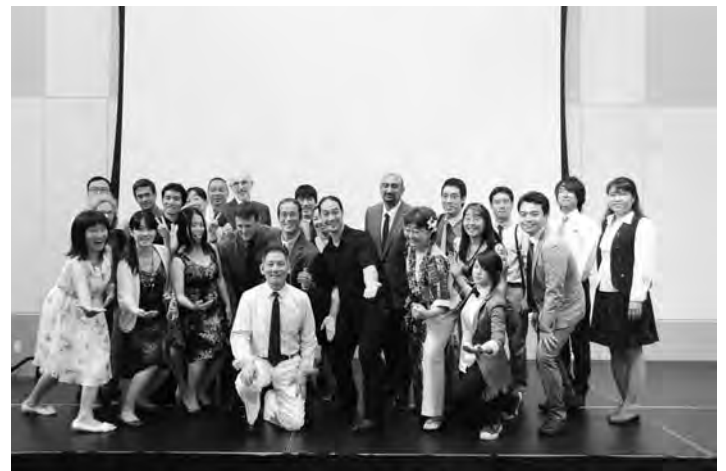
Members of Seikyu Kai.

The continuing success of Seikyu Kai is due in large part to the dedication of our teacher and especially the long-term volunteer instructors, who serve as role models for kyudo practice. Riding on our waves of success, we hope that one day Seikyu Kai will host the first-ever Kyudo Association of Canada International Kyudo Seminar, with generous support from the JCCC. In the meantime, we will continue to polish ourselves and our techniques to realize this dream.