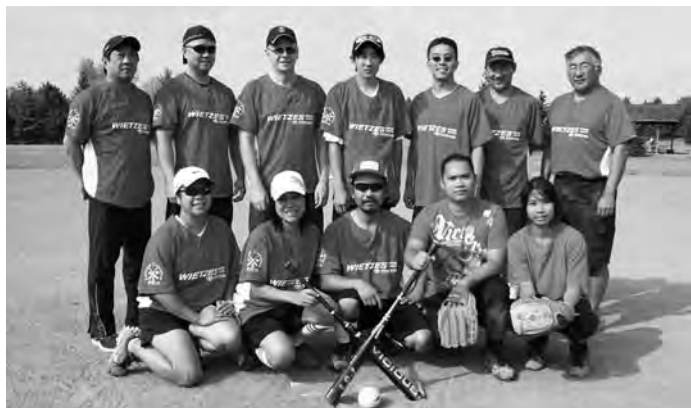
Wietzes Toyota League Championship Team (Left to Right):