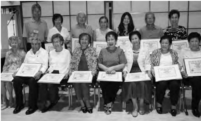
2012 Ontario Volunteer Service Award Recipients.