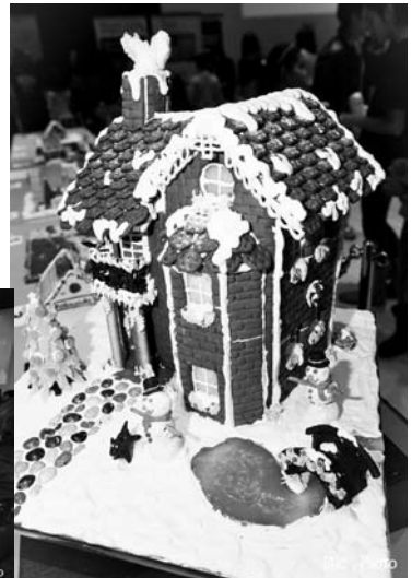
Snapshots from the Winter Family Festival, including the winner of the Gingerbread House Contest.

We would like to give a huge thank you to the volunteers, sponsors, staff, and members of the Winter Family Festival planning committee for their help and support. Without them, the event would not have been as successful as it was. Seeing smiles everywhere and with so much positive response from the community, we are looking forward to a wonderful festival again later this year!